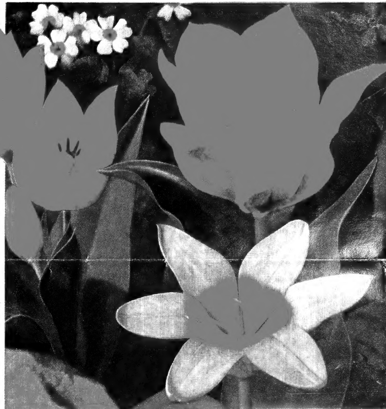
Praestans Fusilier, 12 for $1.60; Red Emperor, 12 for $1.40; Kaufmanniana, 12 for $1.75.